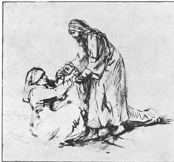
Healing Peter's Mother-in-Law

In the mercy of almighty God, Jesus Christ was given to die for us, and for his sake God forgives us all our sins. As a called and ordained minister of the church of Christ, and by his authority, I therefore declare to you the entire forgiveness of all your sins, in the name of the Father, and of the + Son, and of the Holy Spirit. Amen.