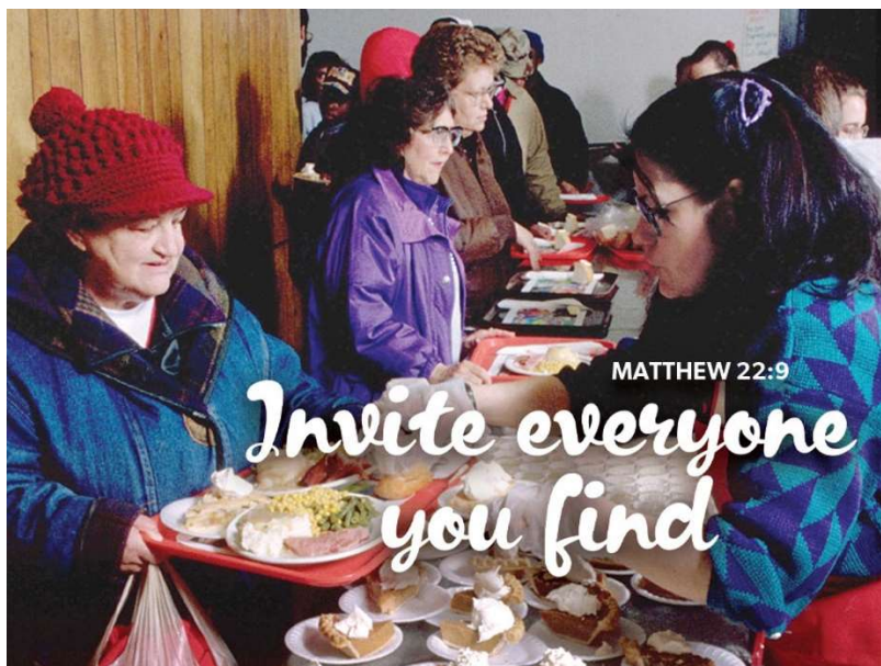
Woman receiving a meal in a church soup kitchen. Copyright © Steve Skjold/ Alamy Stock Photo. Used by permission.

OFFICE@TRINITYCHURCHVIRGINIA.ORG OCTOBER 15, 2023 PENTECOST 20