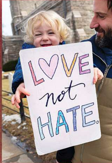
Child holding peaceful protest sign.

OFFICE@TRINITYCHURCHVIRGINIA.ORG FEBRUARY, 23 2025 EPIPHANY 7